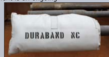
POSTALLOY® HB INSULATOR